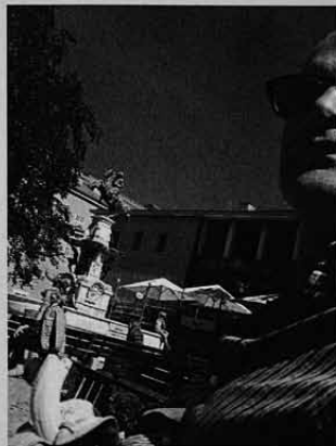
Innsbruck 6. September 2011 13:37