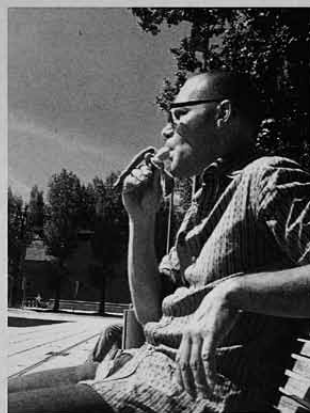
Innsbruck 6. September 2011 13:58