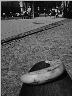
Innsbruck 6. September 2011 13:30