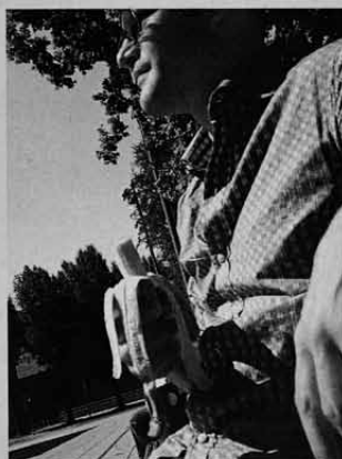
Innsbruck 6. September 2011 13:52